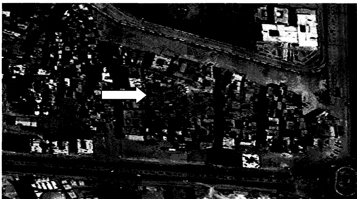
Digital Globe World View 1 – 27 July