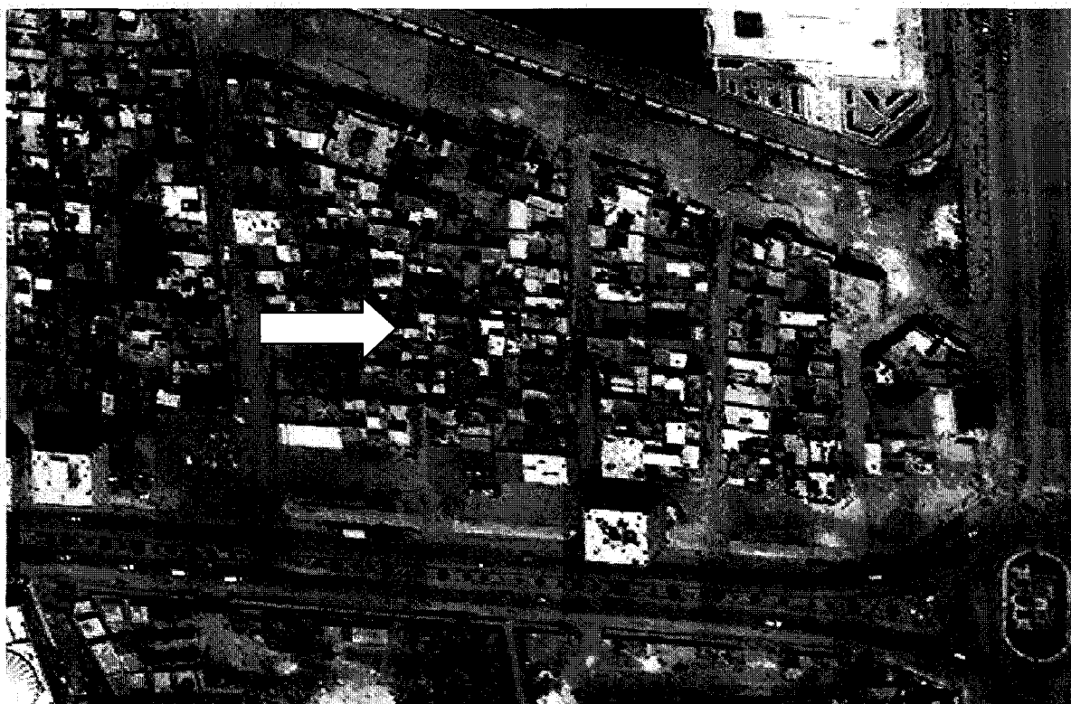
Digital Globe World View 1 – 13 May