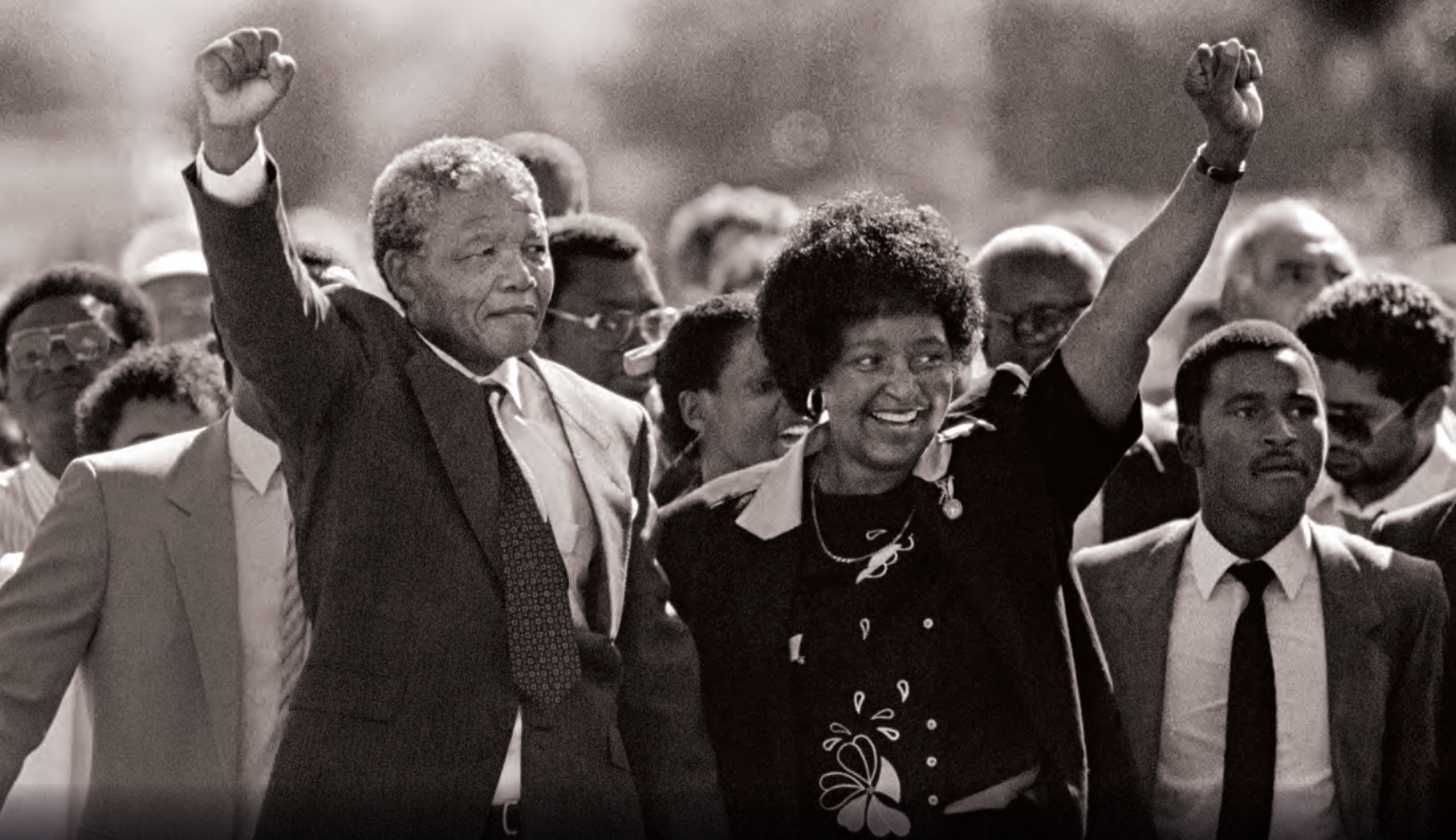
Nelson Mandela walks to freedom after more than two decades in prison, accompanied by his then wife, Winnie Madikizela-Mandela 11 February 1990, Paarl, South Africa