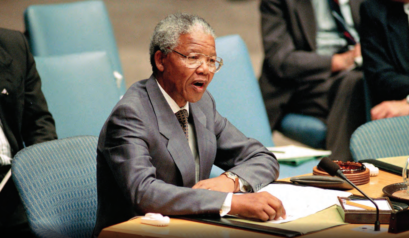
Nelson Mandela, President of the African National Congress (ANC), addresses the Security Council 15 July 1992, United Nations, New York, USA