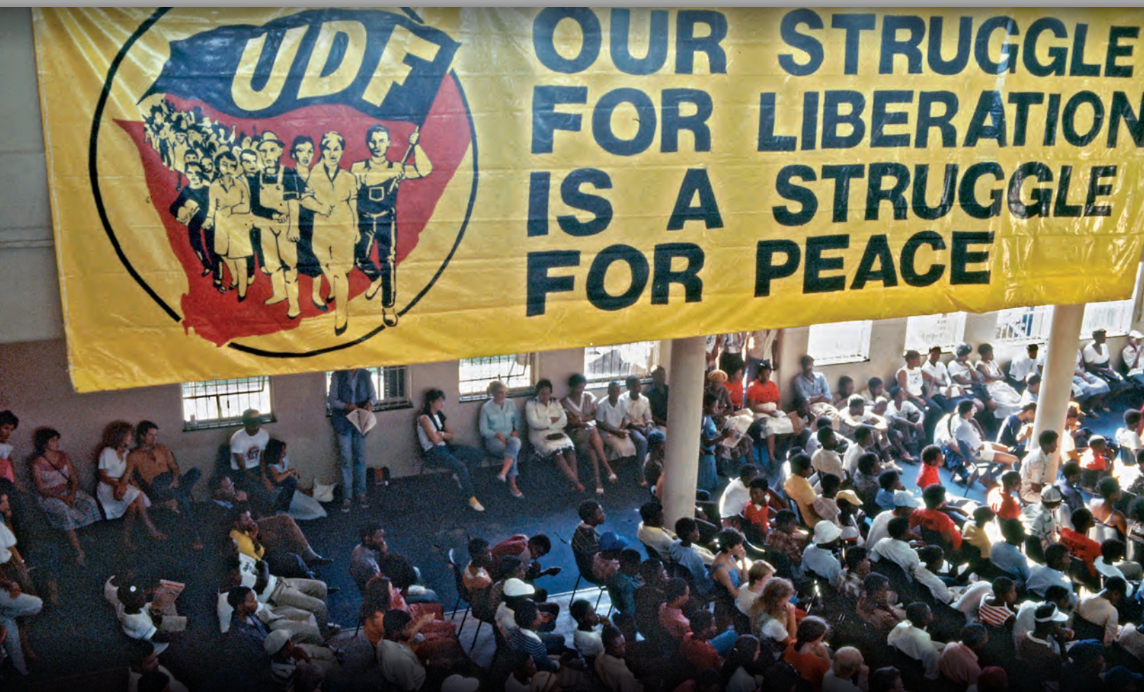
Protest meeting of the United Democratic Front (UDF) in Johannesburg | 1 March 1985, Johannesburg, South Africa

STATEMENT FROM THE DOCK AT THE OPENING OF THE DEFENSE CASE IN THE RIVONIA TRIAL, PRETORIA, SOUTH AFRICA, 20 APRIL 1964