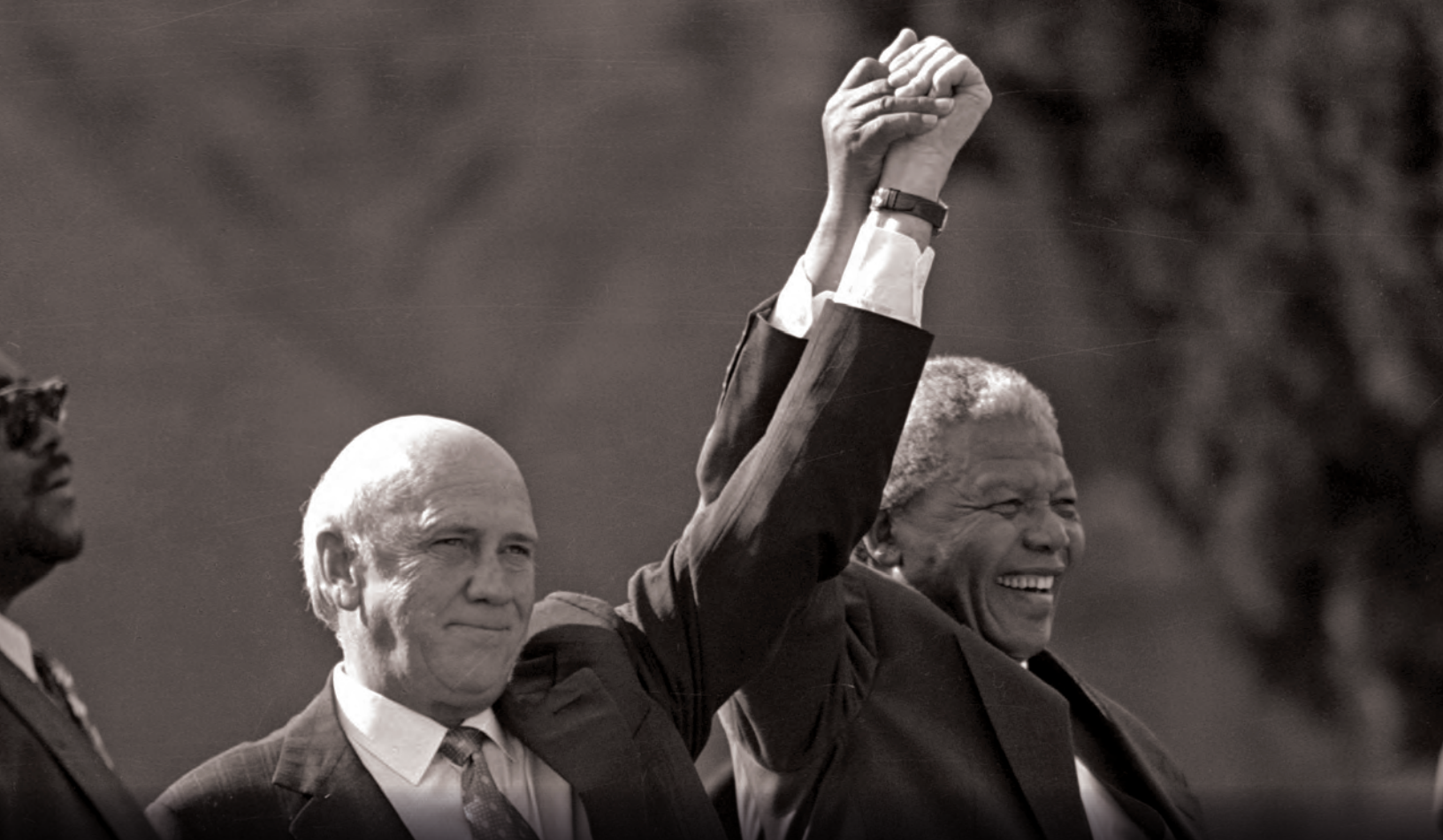
Former Head of State President F.W. de Klerk and Nelson Mandela after Mr. Mandela's presidential inauguration 10 May 1994, Pretoria, South Africa