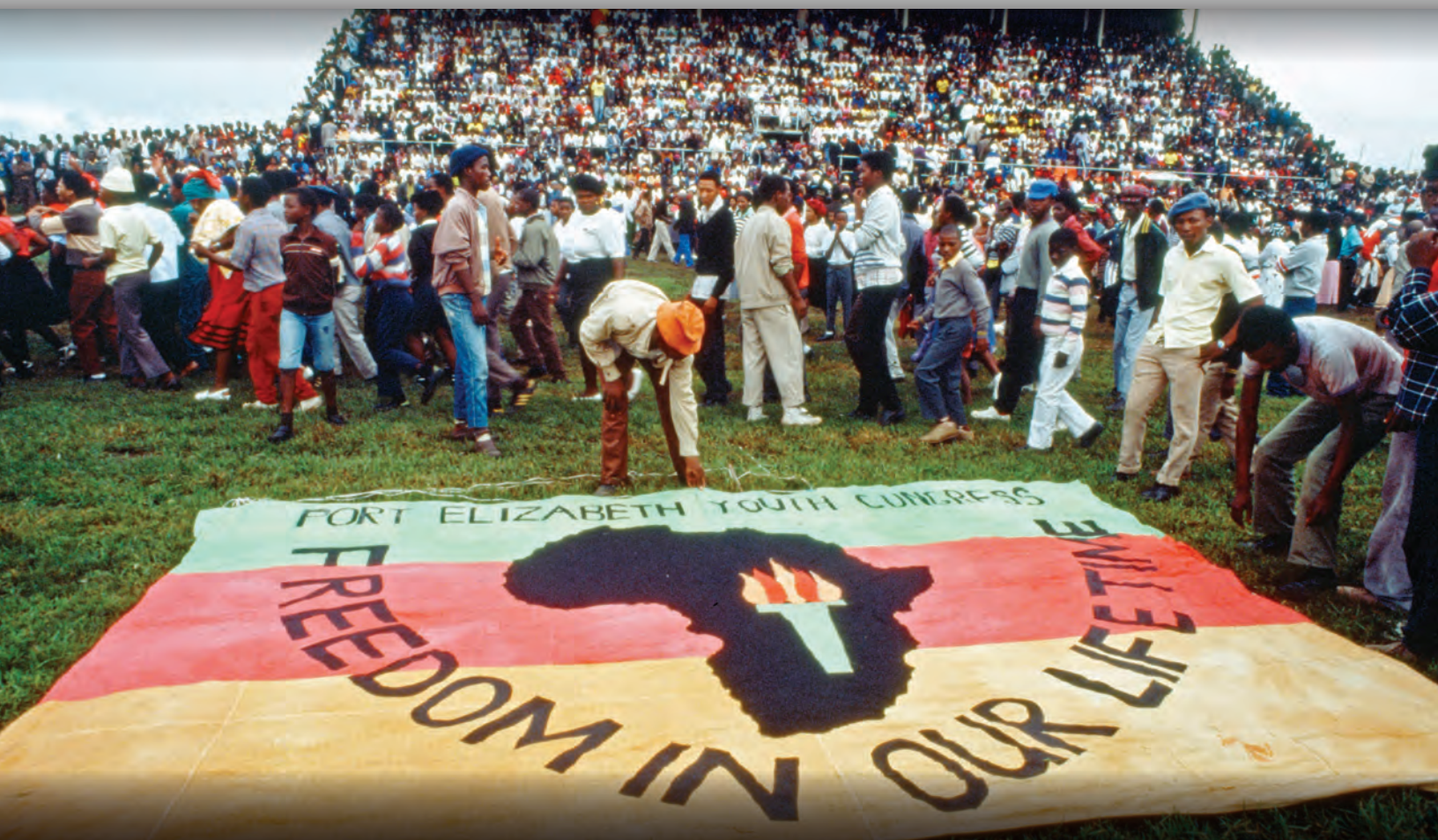
Mourners at a funeral ceremony for those killed by South African police at Langa Township in Uitenhage 21 March 1985, Cape Province, South Africa

COURT STATEMENT, PRETORIA, SOUTH AFRICA, 15 OCTOBER–7 NOVEMBER 1962