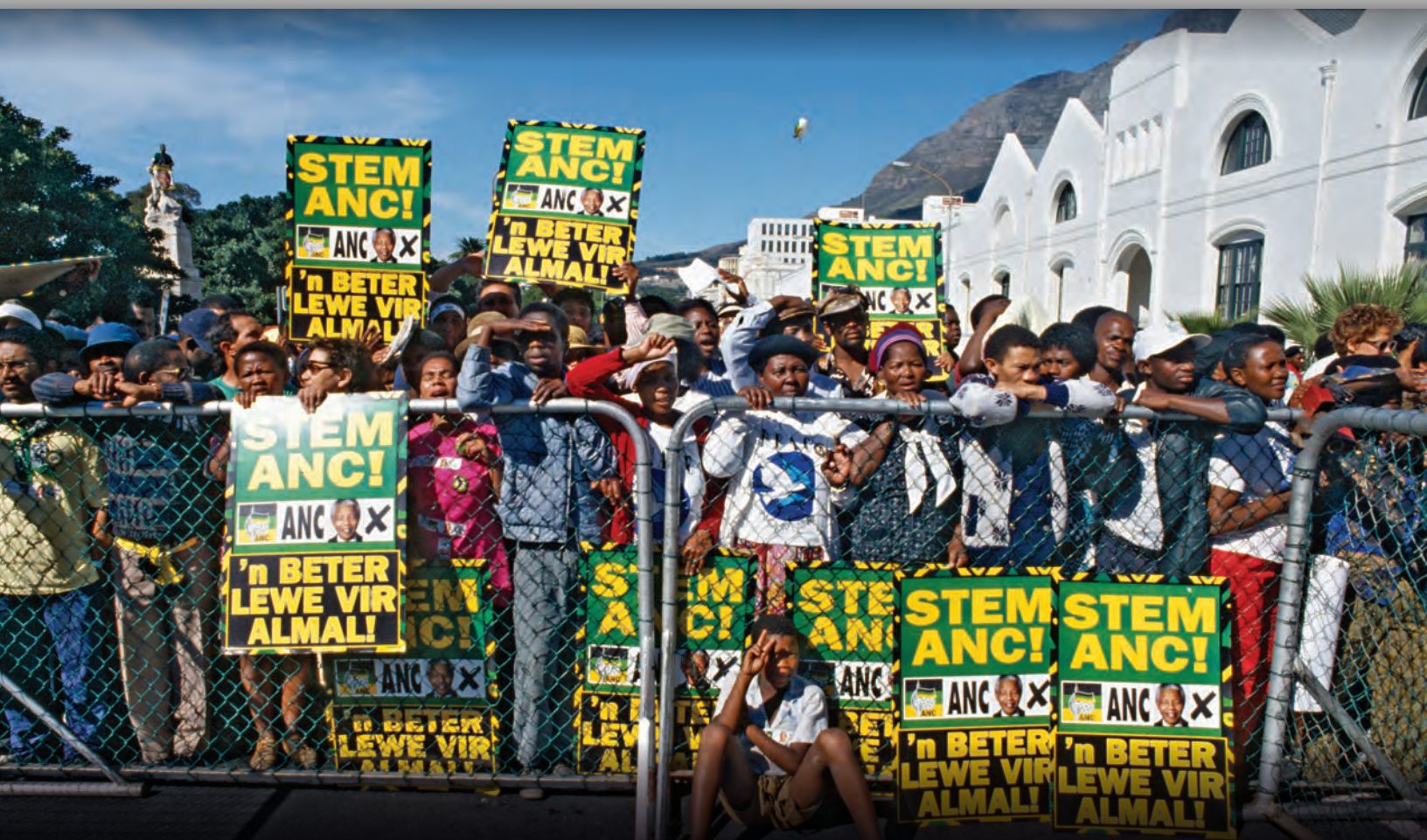
Jubilant crowds listen to the speech of President Nelson Mandela at his inauguration as South Africa's first black president 10 May 1994, Pretoria, South Africa

“We have waited too long for our freedom.”