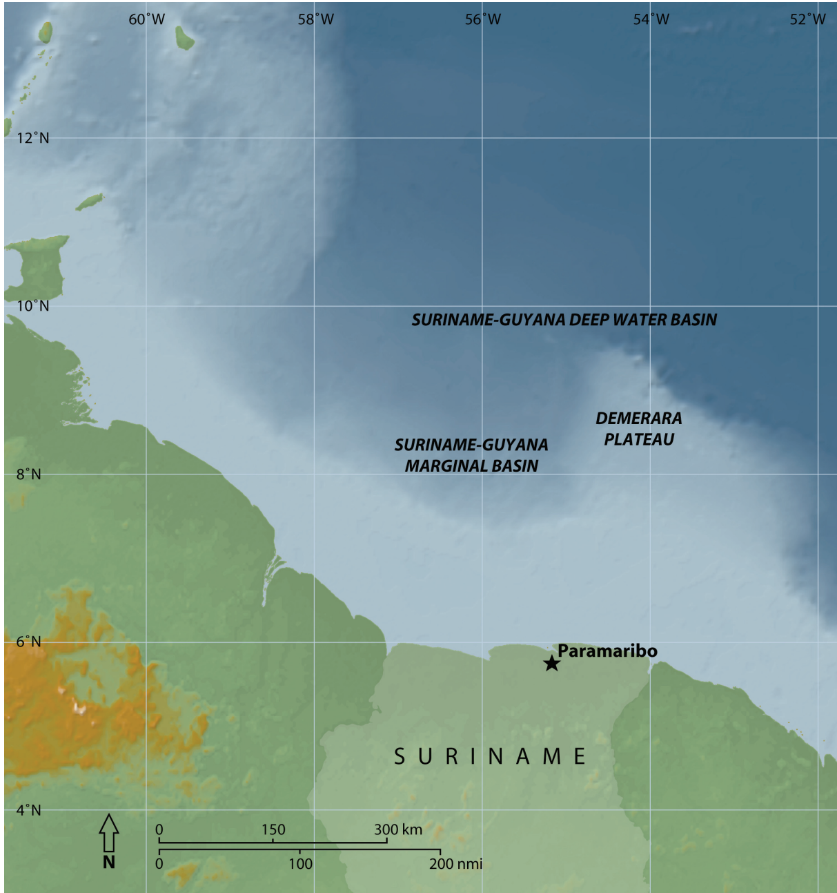
Figure 1: Map showing the region with the Demerara Plateau and the Suriname-Guyana Deep Water Basin.