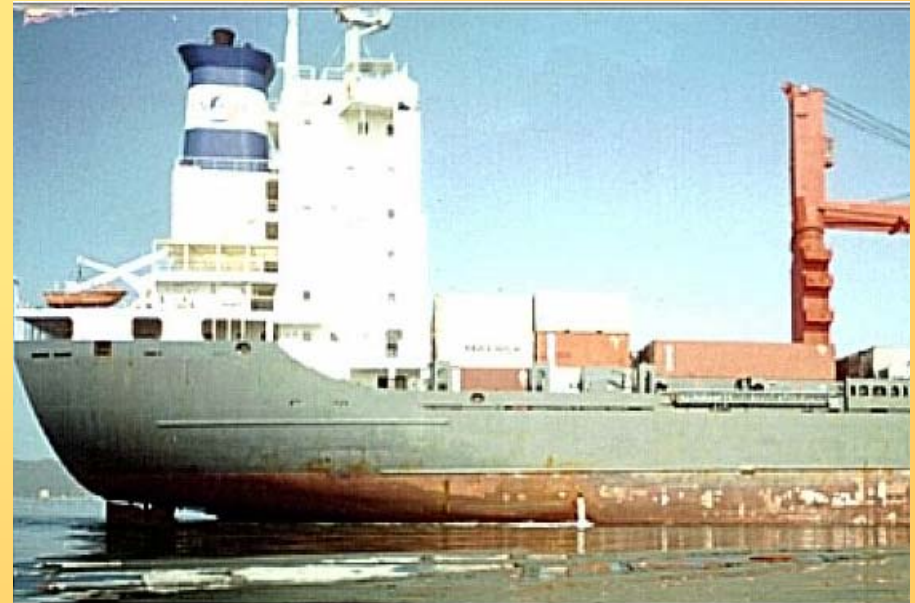
Ship releasing ballast water into Kingston Harbour