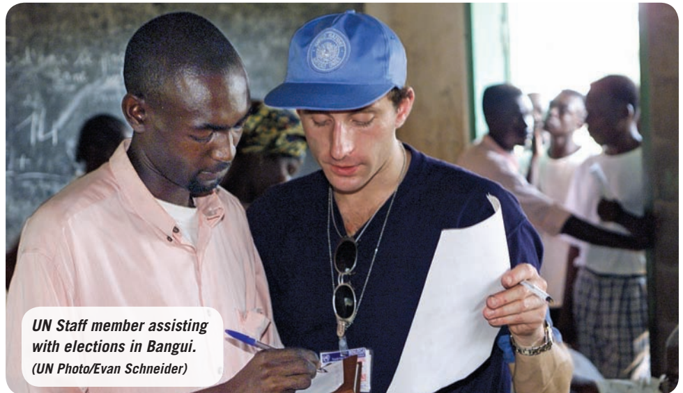
UN Staff member assisting with elections in Bangui.

In cooperation with UNDP's PRED, BINUCA supports activities such as seminars on the newly promulgated criminal and criminal procedure codes for the benefit of judges, lawyers, law professors, court clerks, penitentiary personnel, police officers and gen-