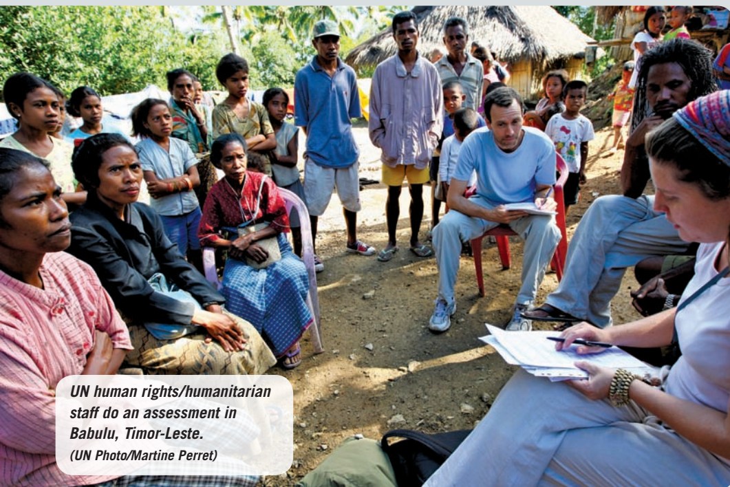
UN human rights/humanitarian staff do an assessment in Babulu, Timor-Leste.

The instrument will be implemented in collaboration with national governments and hopefully adopted by them as an ongoing monitoring mechanism. Participating countries will find this instrument very useful for monitoring their own progress in reforming or rebuilding their criminal justice institutions and strengthening the rule of law. The instrument will also provide and summarize accurate information which the United Nations, donors and development partners will be able to use to plan and monitor the impact of their efforts to rebuild the capacity of criminal justice institutions and, more generally, strengthen the rule of law. Additionally, the process of implementing the indicators will strengthen relationships between the United Nations and participating national governments, relationships that are crucial to the United Nations objectives of promoting peace and security in conflict and post-conflict countries and building sustainable criminal justice institutions that provide equal access to justice for all individuals. ■