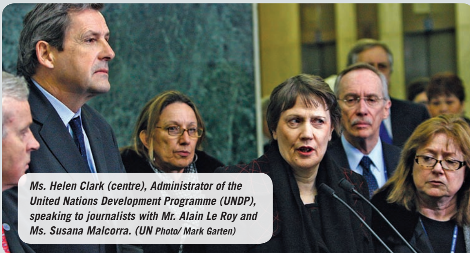
Ms. Helen Clark (centre), Administrator of the United Nations Development Programme (UNDP), speaking to journalists with Mr. Alain Le Roy and Ms. Susana Malcorra.