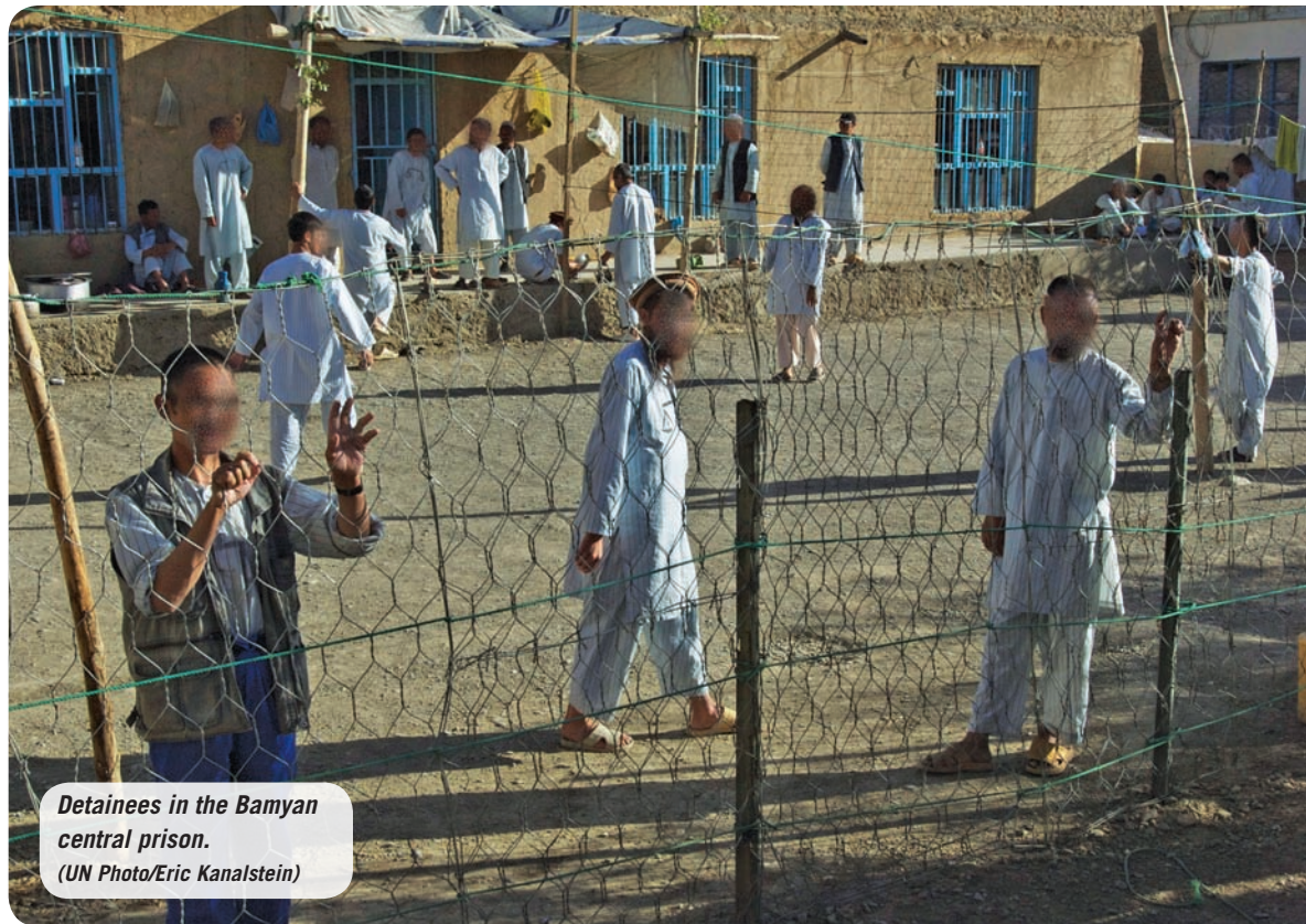
Detainees in the Bamyan central prison.

With its presence in the provinces, UNAMA, through the PJCM, is widely seen by national authorities and international stakeholders as the entity best suited to facilitate provincial justice coordination. The PJCM has been effective in assisting the Govern-