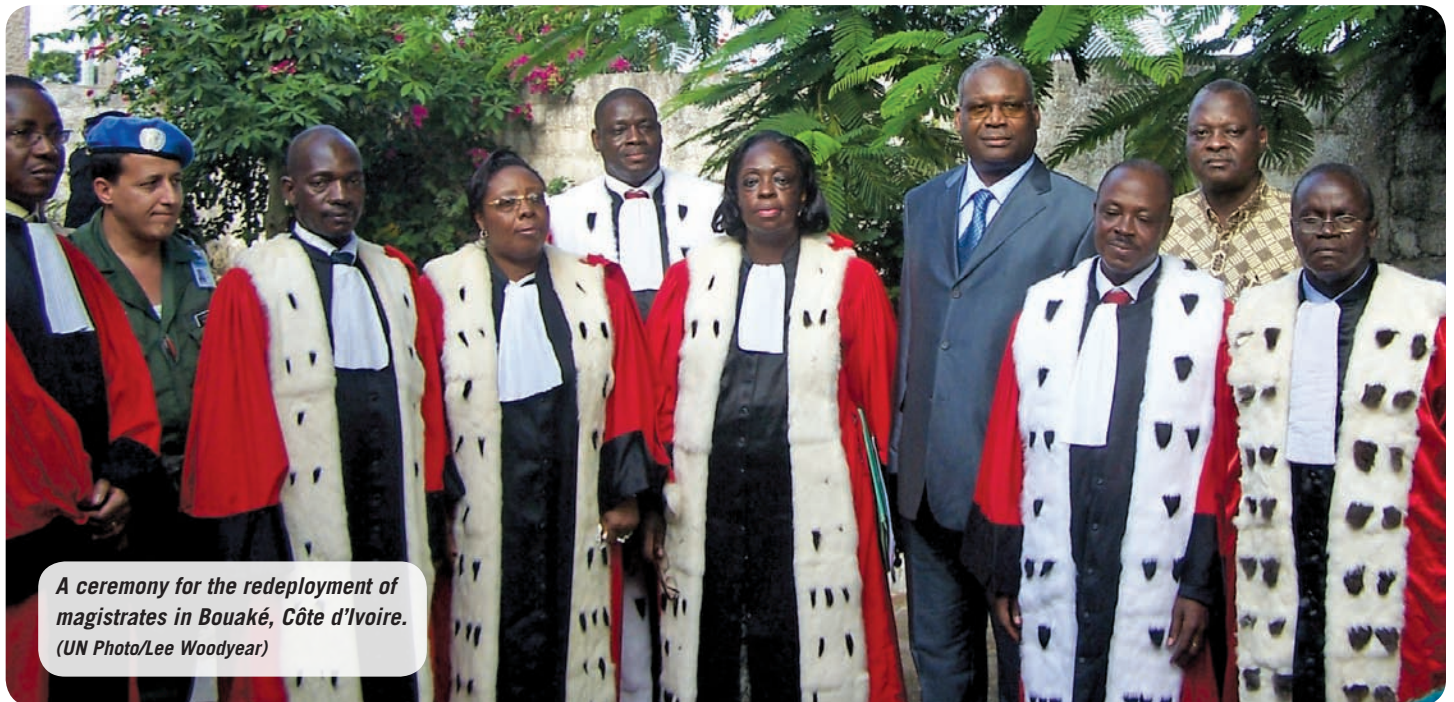
A ceremony for the redeployment of magistrates in Bouaké, Côte d'Ivoire.

In support of the elections, the Section also assisted the mobile courts with the task of identifying and registering voters without official papers and monitored the process of appeals from the provisional voter list. ■