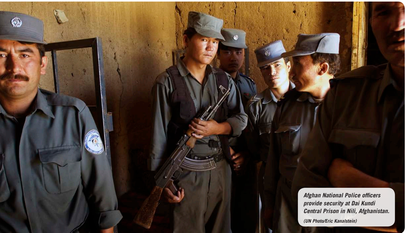
Afghan National Police officers provide security at Dai Kundi Central Prison in Nili, Afghanistan.

Coordination meetings addressed a wide range of problems, from