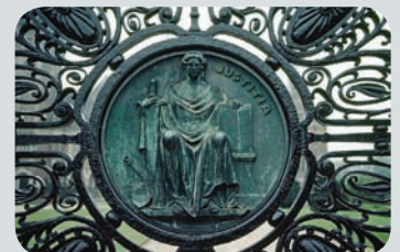
FRONT COVER IMAGE: A symbol depicting justice at the entrance to the Peace Palace, home of the International Court of Justice, at The Hague in the Netherlands.