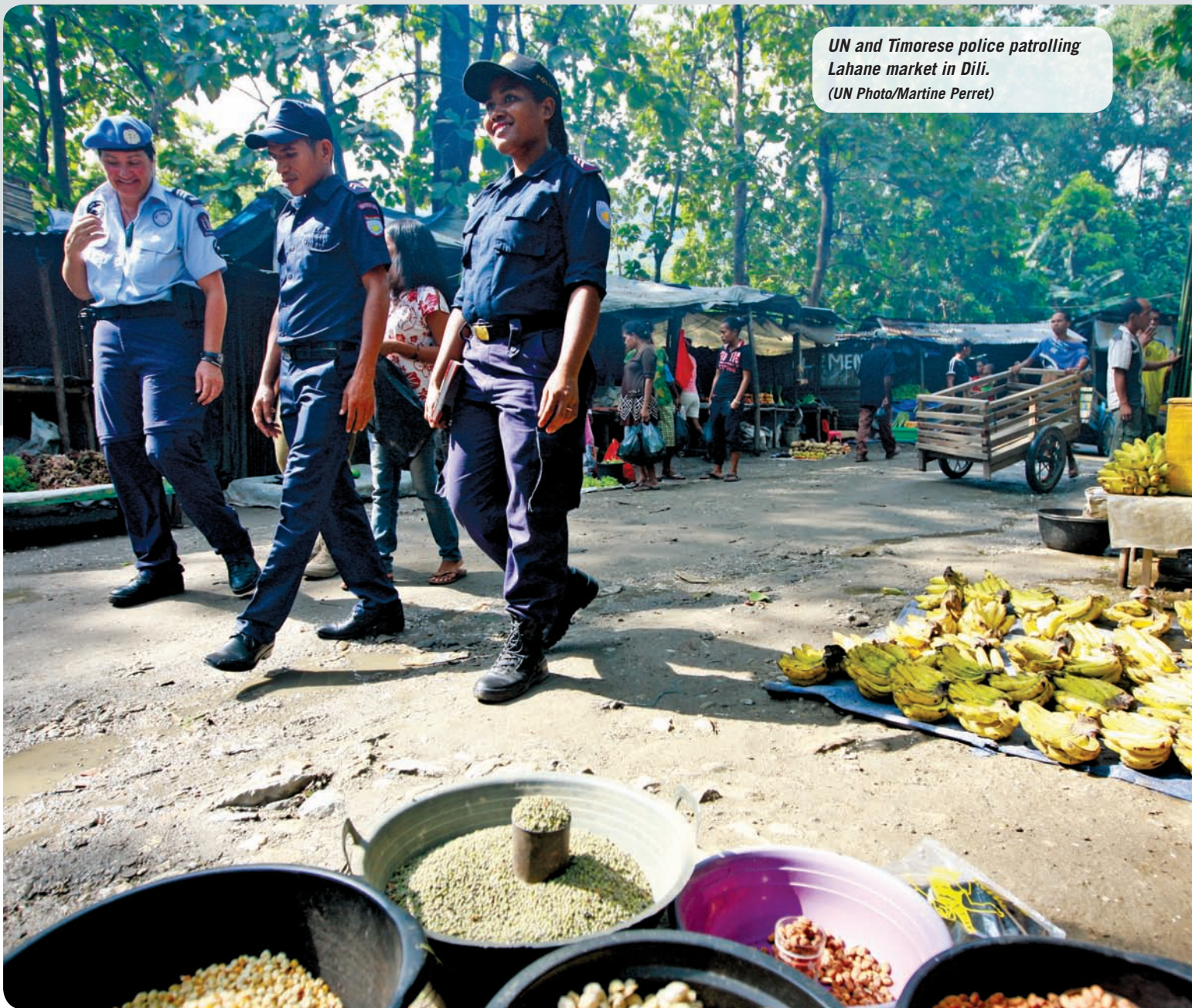
UN and Timorese police patrolling Lahane market in Dili.

violence and protect and give assistance to domestic violence victims. By law, the legal and medical providers must document relevant facts, report the case to the police or prosecutor and refer the survivor to further service providers e.g. shelters or counsellors as necessary. Implementation of the Law Against Domestic Violence is only just beginning, but the existence of the law and its categorization of domestic violence as a public crime signify very important steps forward in the struggle to end violence against women in Timor-Leste. ■