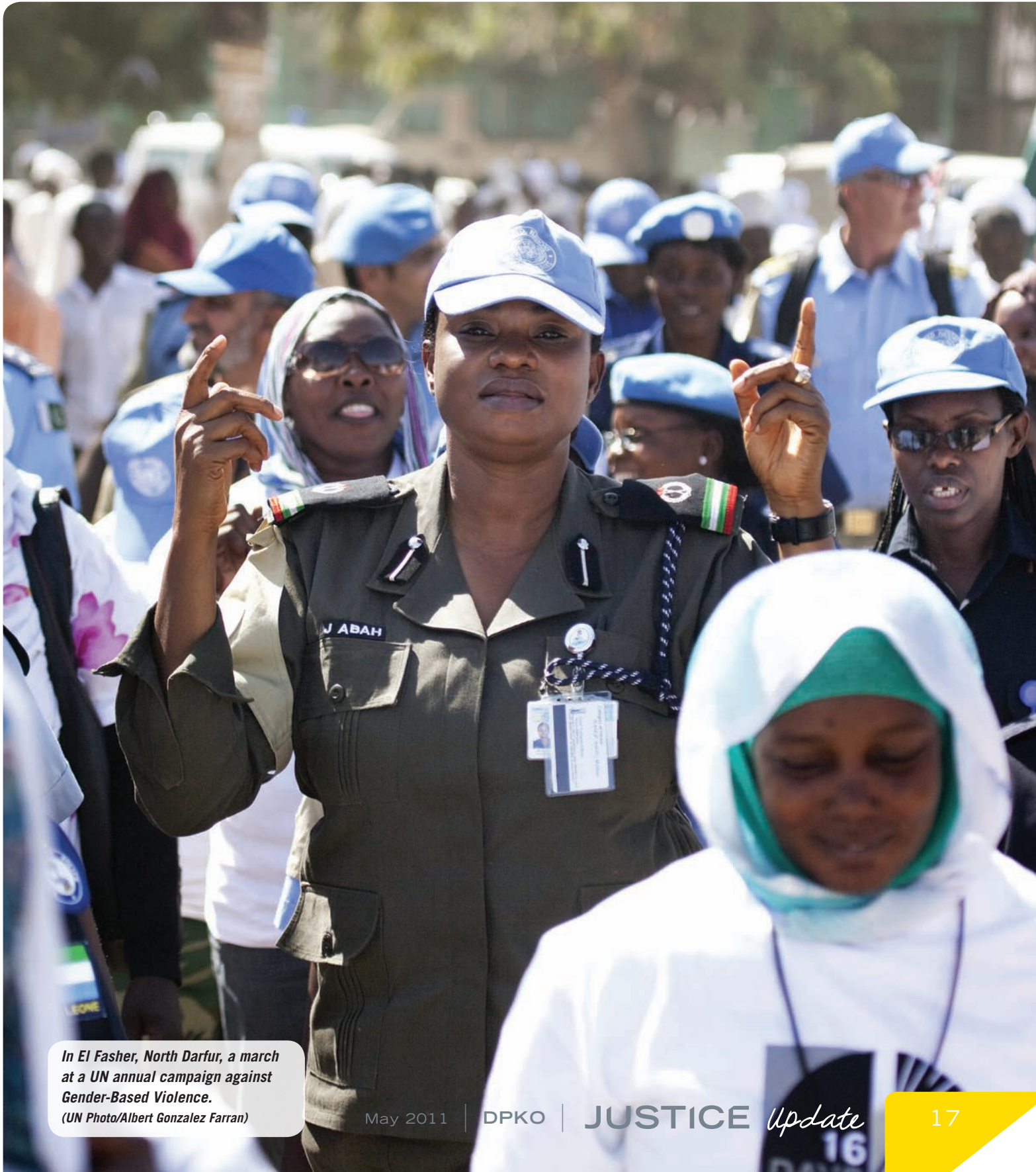
In El Fasher, North Darfur, a march at a UN annual campaign against Gender-Based Violence.