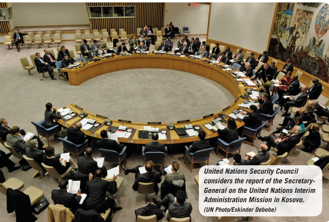
United Nations Security Council considers the report of the Secretary-General on the United Nations Interim Administration Mission in Kosovo.

Since the last Justice Update (April 2010), UNMIK has monitored the appointment process for legal positions within the Kosovo justice system and has provided technical assistance and advice where requested. The Independent Judicial and Prosecutorial Commission recently completed the initial process of appointment of judges and prosecutors and transferred its duties to the Kosovo Judicial Council. It was important that UNMIK ensure the process was merit-based and conducted in accordance with European Commission standards, and the process was conducted fairly and efficiently, without political interference, with adequate minority representation, and with mechanisms in place to review appointment decisions.