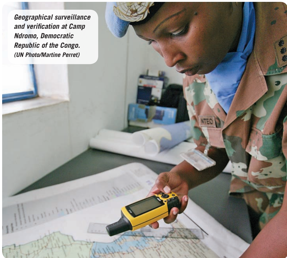
Geographical surveillance and verification at Camp Ndro, Democratic Republic of the Congo.

to host state authorities, mapping and assessment may be used to inform the Secretary-General's reports to the Security Council, the Security Council resolutions, mission and component concepts of operations and work plans. During the mandate implementation phase, the results of earlier mapping exercises should be updated regularly, and assessments should continue to be carried out on an ongoing basis. The findings, analyses and recommendations arising from mapping and assessment activities enable national and international actors to target resources for strengthening police and other law enforcement agencies, and justice and corrections institutions. The guidelines are expected to be finalized in late 2011. ■