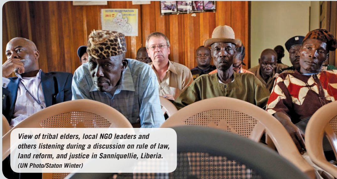
View of tribal elders, local NGO leaders and others listening during a discussion on rule of law, land reform, and justice in Sanniquellie, Liberia.

ber by a technical advisory team including staff from UNMIL, DPKO/OROLSI, UNDP/BCPR, PBSO and UNICEF. The efforts on the hub project exemplify a commitment to leverage the comparative advantage of each member of the UN family. For the PBF specifically, the "Quick Start" to the Gbarnga hub project demonstrates its capacity to catalyze peacebuilding processes by providing rapid funding.