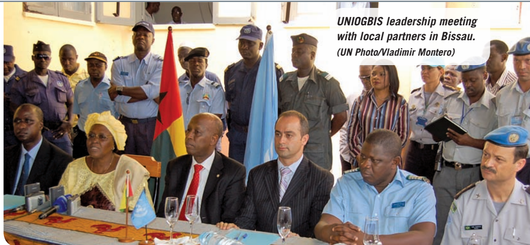
UNIOGBIS leadership meeting with local partners in Bissau.

In May 2010, in order to enhance cooperation among key criminal justice institutions and improve communication and information-sharing among senior and mid-level police managers, prosecutors, magistrates and other stakeholders from civil society and international organizations, UNIOGBIS organized a national workshop with these constituents. The event helped to cultivate mutual understanding and professional relationships, and provided a unique opportunity for top-level officials to address common challenges and discuss mutual concerns. The participants identified a number