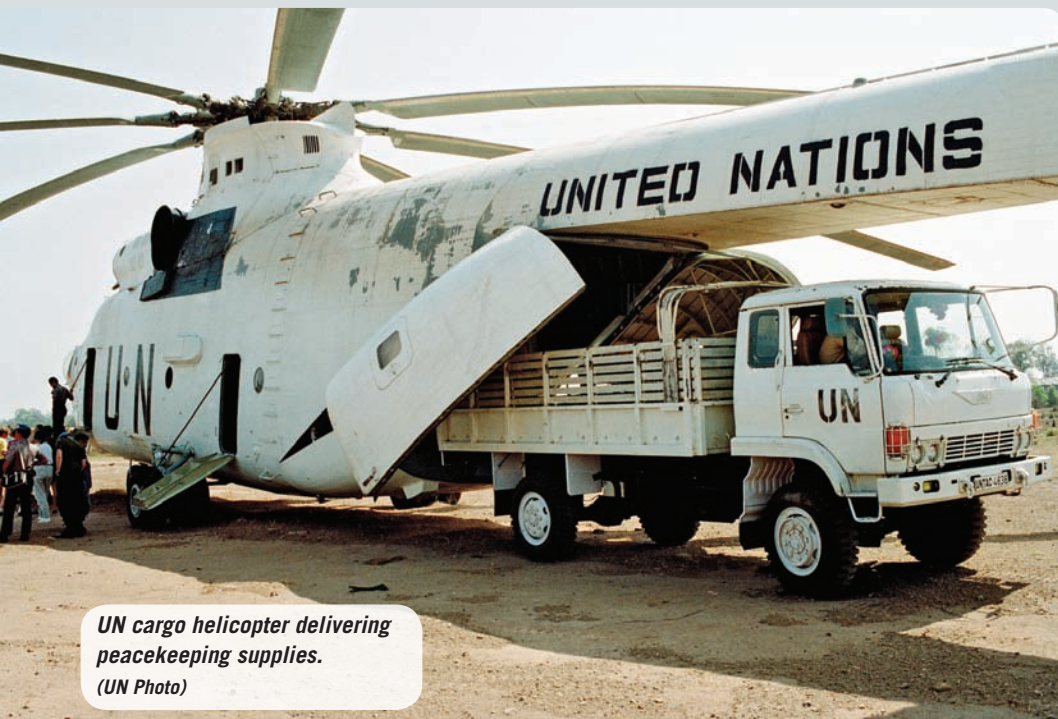
UN cargo helicopter delivering peacekeeping supplies.

JCSC officers will be expected to deploy at short notice upon the direction of the Under-Secretary-General for Peacekeeping Operations and are expected to spend up to 70 per cent of their time deployed to the field. During their time at UNLB, officers will debrief, develop after-action reviews, contribute to lessons learned and best practice studies, attend the necessary training sessions and prepare for the next field assignment. ■