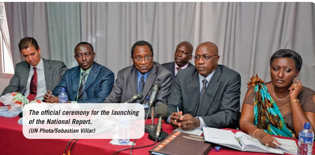
The official ceremony for the launching of the National Report.