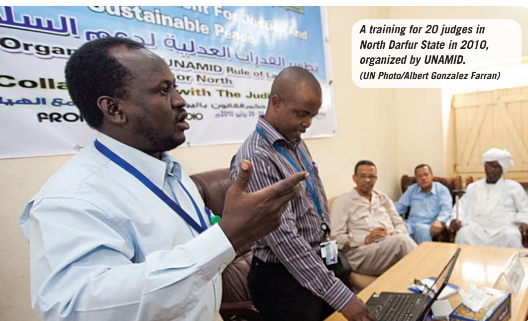
A training for 20 judges in North Darfur State in 2010, organized by UNAMID.

Participants in the programme were trained on the provisions of the Sudanese Criminal Law, Evidence Act, Criminal Procedure Act and the Child Act relevant to gender-based violence and child-related offences. The training emphasized the role of police reporting, apprehending, conducting searches, investigating and prosecuting cases of GBV. This programme is a precursor to the upcoming Integrated Strategic Framework (ISF) for Darfur which seeks a one UN approach to rule of law and other development projects for Darfur. ■