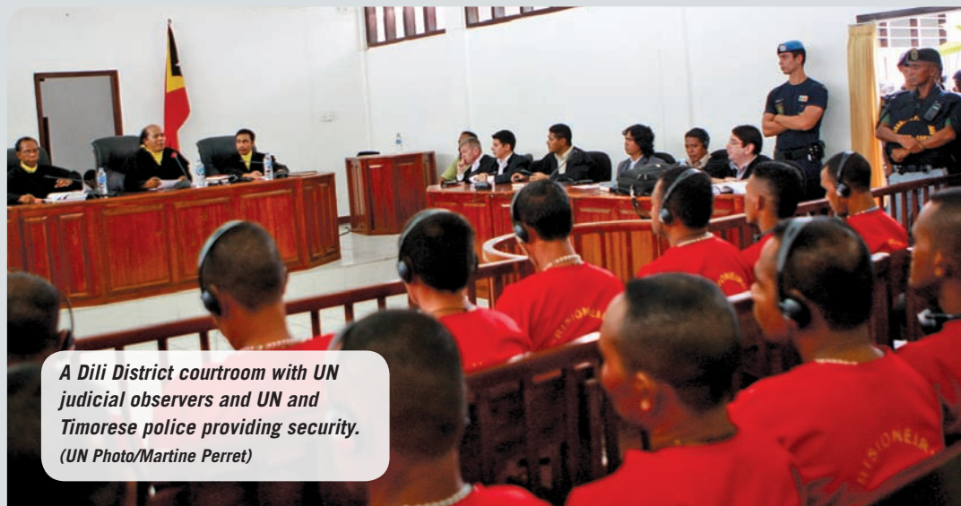
A Dili District courtroom with UN judicial observers and UN and Timorese police providing security.

well as that of the legal and health care professionals. One of the most important elements of the law is that domestic violence is categorized as a public crime, thereby raising the seriousness of the crime, obligating police and prosecutors to investigate and prosecute, and removing the