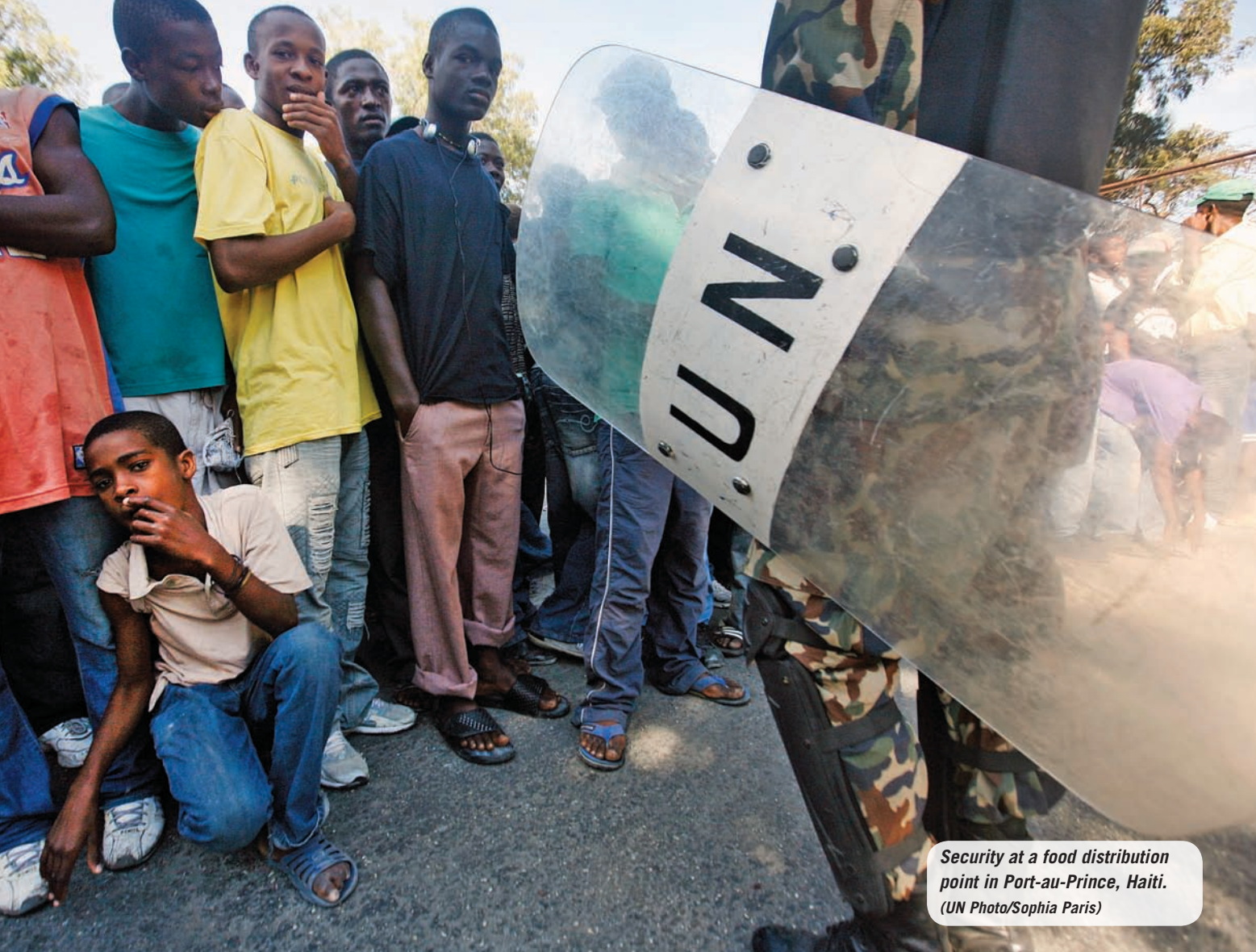
Security at a food distribution point in Port-au-Prince, Haiti.