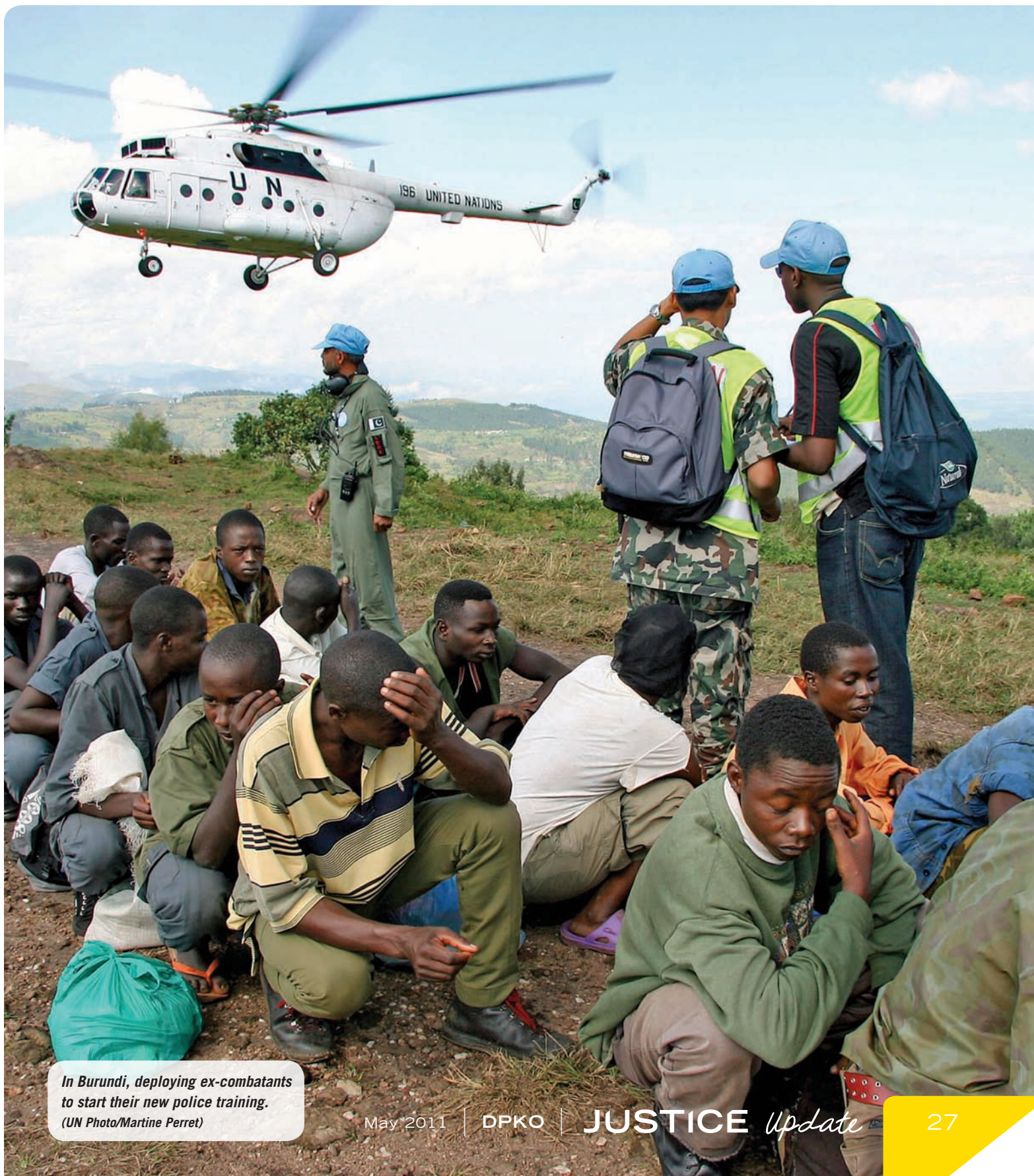
In Burundi, deploying ex-combatants to start their new police training.