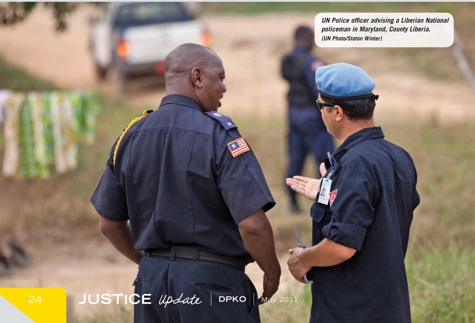
UN Police officer advising a Liberian National policeman in Maryland, County Liberia.

Access to justice and security, in particular, continues to be limited for many Liberians, particularly those outside of the capital Monrovia, despite the advances Liberia has made in police reforms, in partnership with UNMIL and other partners. The