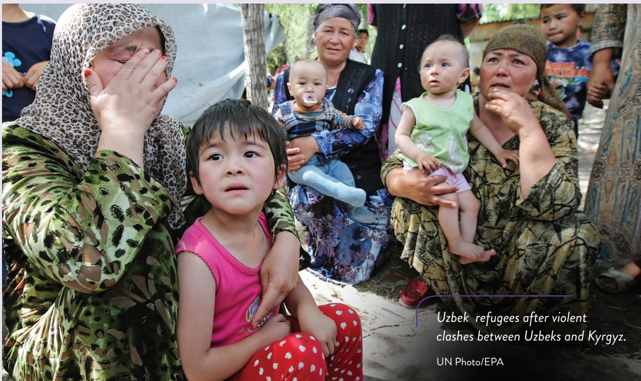
Uzbek refugees after violent clashes between Uzbeks and Kyrgyz.