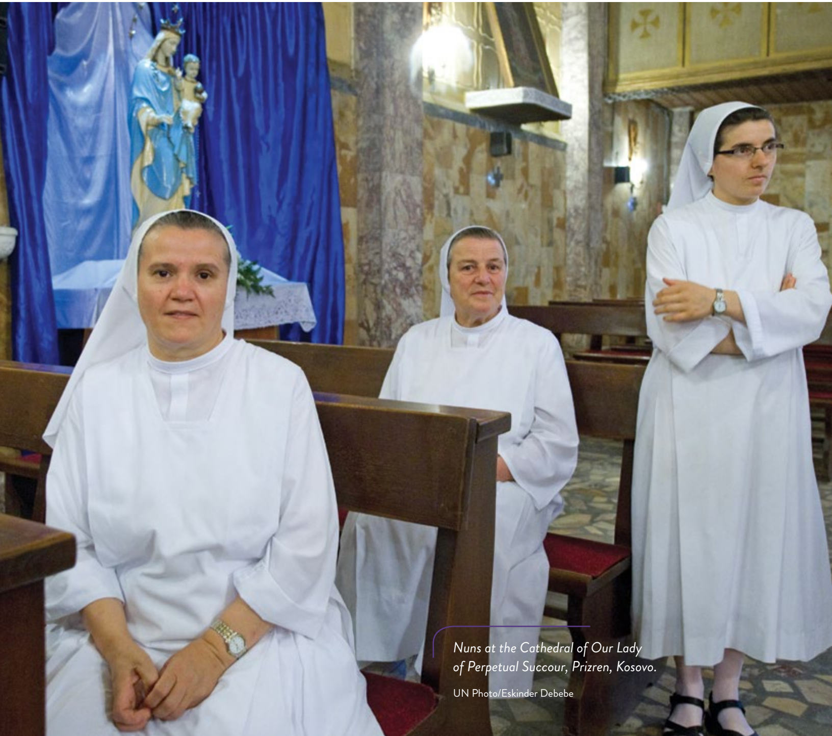
Nuns at the Cathedral of Our Lady of Perpetual Succour, Prizren, Kosovo.

Religious leaders and actors can be strong partners in the prevention of atrocity crimes and their incitement and, for this reason, national, regional and international institutions, civil society and the media should engage and cooperate with religious leaders in the context of efforts to prevent atrocity crimes.