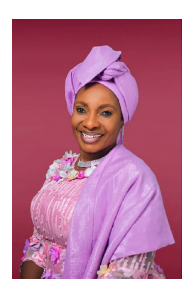
H.E. Jacqueline O'Neill, Canada's Ambassador for Women, Peace and Security

"Hate speech, with its venomous branches, threatens the very fabric of our communities and has the potential to unleash violence and atrocities, as we have witnessed in countries that have witnessed genocide. It begins with little gossips and then escalates beyond the ordinary and before you know it, the society is on fire, causing destruction to lives and properties. Of course, women and girls become the worst victims. The Plan of Action we are unveiling today is a testament to our shared determination to address the root causes of hate speech and prevent the escalation of violence into unimaginable atrocities."