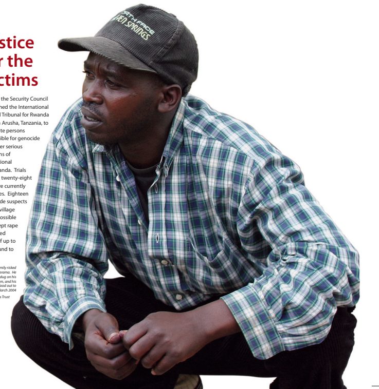
Profound knowledge right and his family visited their lives to prevent 14 Tutsis in Gikoma. He hid them in covered trenches that he dug on his land. His cover lasted for three months. 12-year-old never would take the food out to them. Pictured in Gikoma, March 2004.