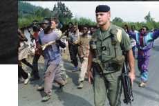
French soldiers in Gikoma, Rwanda, 27 June 1994.

On 17 May 1994, with the genocide finally undeniable, the UN Security Council voted to expand the UN peacekeeping mission to 5,500 peacekeepers with the mandate "to contribute to the security and protection of displaced persons, refugees and civilians at risk in Rwanda". However, no reinforcements arrived. A separate multinational force, led by France and authorized by the Council to use force to establish secure conditions for humanitarian relief, was deployed in late June. "Operation Turquoise" is credited with saving lives within the safe zone it established, but controversy over its full role continues. When the RPF forced the extremist government out of power and ended the genocide, soldiers, officials and militia were able to use the safe zone to flee into Zaire (now the Democratic Republic of Congo). Some of these soldiers and militia would later conduct incursions into Rwanda and participate in the ten-year war in the DRC which claimed over three million lives.