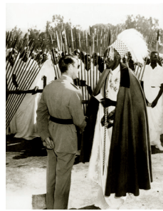
Belgian King Rudolphe welcomed by King Mutara RWandolige (1911-1915) who worked in the beginning in close cooperation with the coloniser. After his coronation of Rwanda to Charles in 1946, the Belgian authorities reshaped Rwandan society according to European and Church values.

Rwanda's three ethnic groups, the majority Hutu, minority Tutsi and smaller Twa population shared a common language, religion and culture. The country was ruled by a predominantly Tutsi monarchy until colonized by Germany in 1895. Belgium took control in 1916. Impressed by the highly developed monarchy and unwilling to accept it as African in origin, colonists and early explorers called the Tutsis a superior "black Aryan" race. Tutsis were given privileged positions in the colonial administration. Hutus were considered second-class "Bantu Negroids" and the Twas "pygmies".