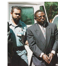
Thoneste Bagesse in Arusha. Bagesse was Chief of Cabinet of the Ministry of Defence at the beginning of the genocide. The alleged mastermind of the genocide, he provided weapons and coordinated the internationalism.