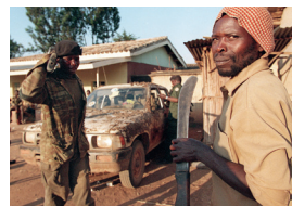
Hutu militiaman with a Government soldier in Gikoma, Rwanda, 12 June 1994. Many militiamen, journalists and police officers saw the killing of the Tutsi as a by-product of civil war. In reality, at the point the genocide began, a ceasefire between the Government and RPF was still in place. The eruption of the genocide triggered renewed hostilities. In the absence of international intervention, defeat of the Government by the RPF brought a tacit end.