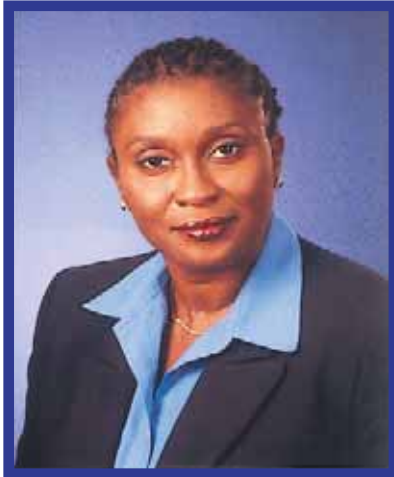
By the Honourable H. Elizabeth Thompson Minister Ministry of Housing, Lands & Environment

Sustainable Development has been on the international agenda for the last decade of the twentieth century. The Government of Barbados has participated in many of the various international discussions on this subject and agrees to the implementation and operationalisation of the principles of Sustainable Development at the national level. In particular, as hosts of the 1994 global Conference on Sustainable Development for Small Island Developing States (SIDS), Barbados is oftentimes perceived as the de facto guardians of the Barbados Programme of Action which is the main outcome of that meeting.