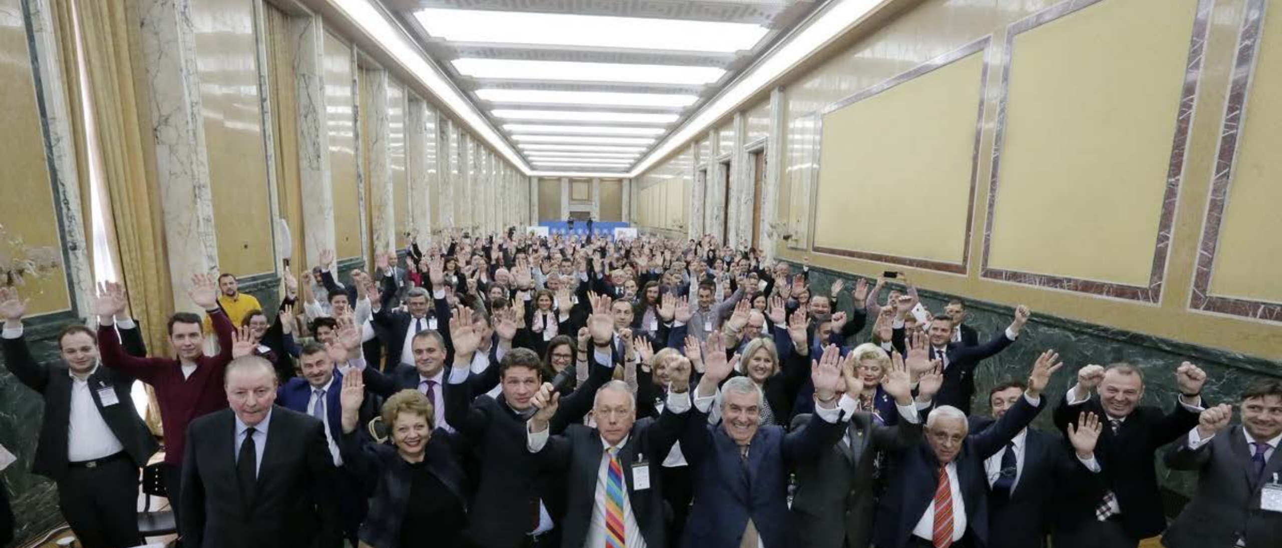
Critical Mass at the Romanian Government Birding the gap between the different stakeholders