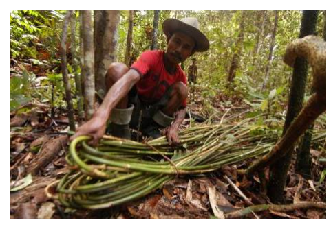
Indonesia Multistakeholder Programme