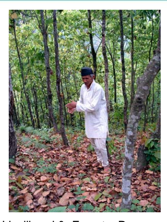
Nepal Livelihood & Forestry Programme