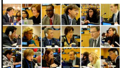
6 Global Forest Goals agreed by UNFF