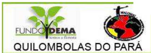
QUILOMBOLAS DO PARÁ