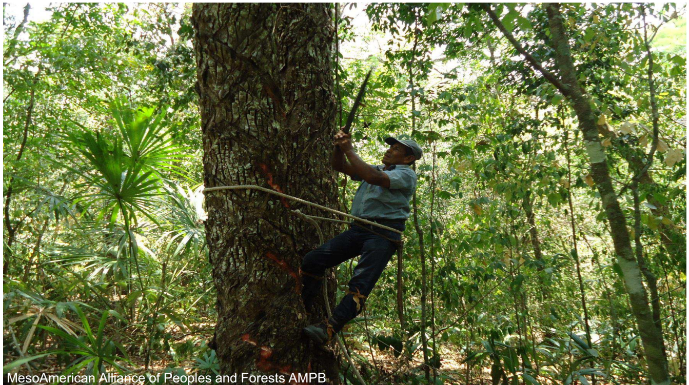
MesoAmerican Alliance of Peoples and Forests AMPB