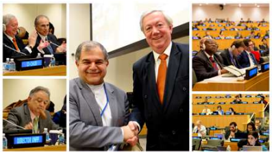
UN Strategic Plan for Forests (2017-2030)