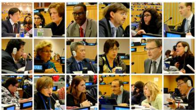
6 Global Forest Goals agreed by UNFF

Vision- The world in which all types of forests and trees outside forests are sustainably managed, contribute to sustainable development and provide economic, social, environmental and cultural benefits for present and future generations