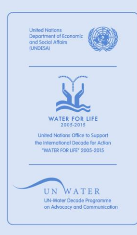
UN-Water Decade Programme on Advocacy and Communication

freshwater withdrawals. On the other side, energy is needed to provide access to water and sanitation.