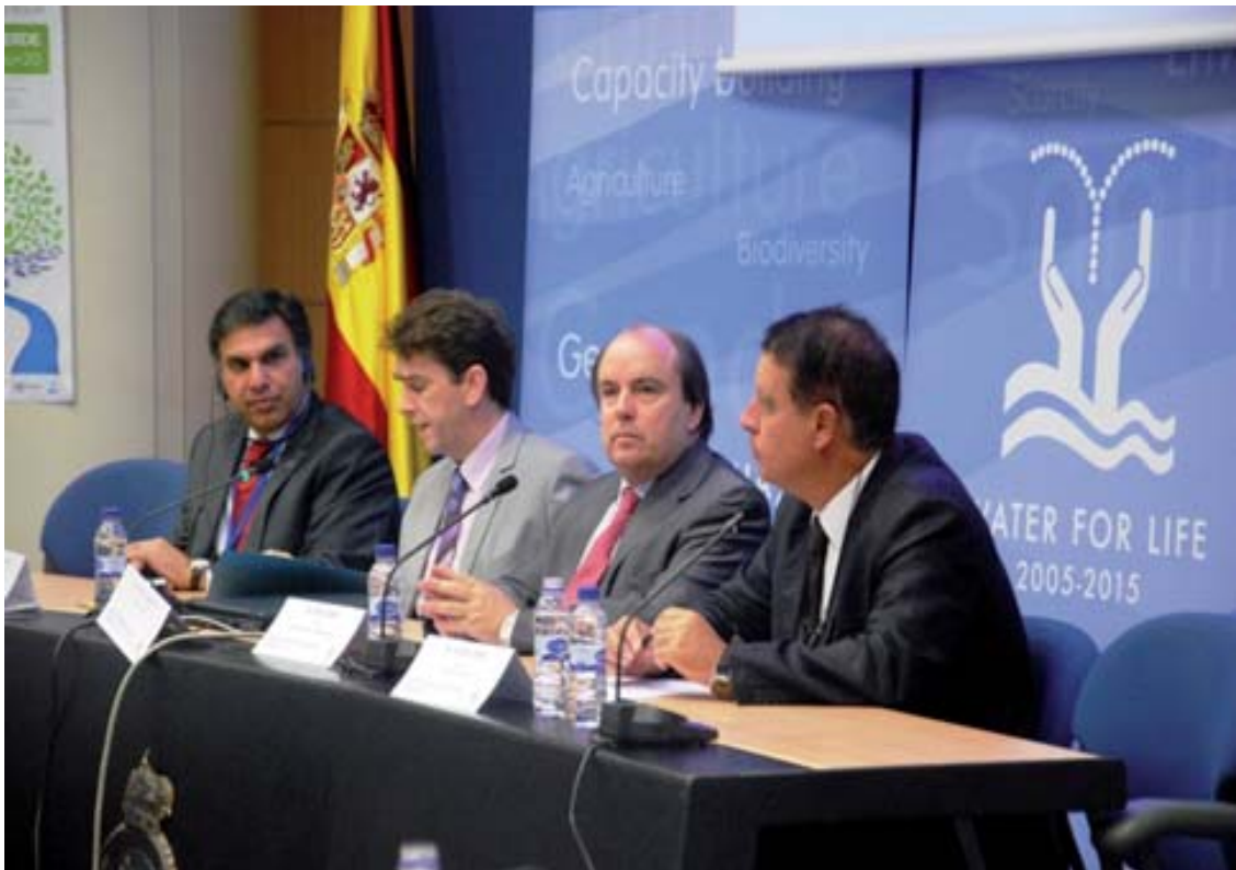
Welcome address by the former President of the Ebro River Basin Authority (Confederación Hidrográfica del Ebro)

In addition to showing the different institutional responses to the above mentioned challenges of water planning, the three Case Studies presented in this document allow making the contrast between countries with an advanced water institutional setting (Spain), transition economies building a sustainable water management institutional set-up (Korea) and other still trying to make water part of a strategy to break up the poverty trap and start a path towards economic progress (Lao PDR).