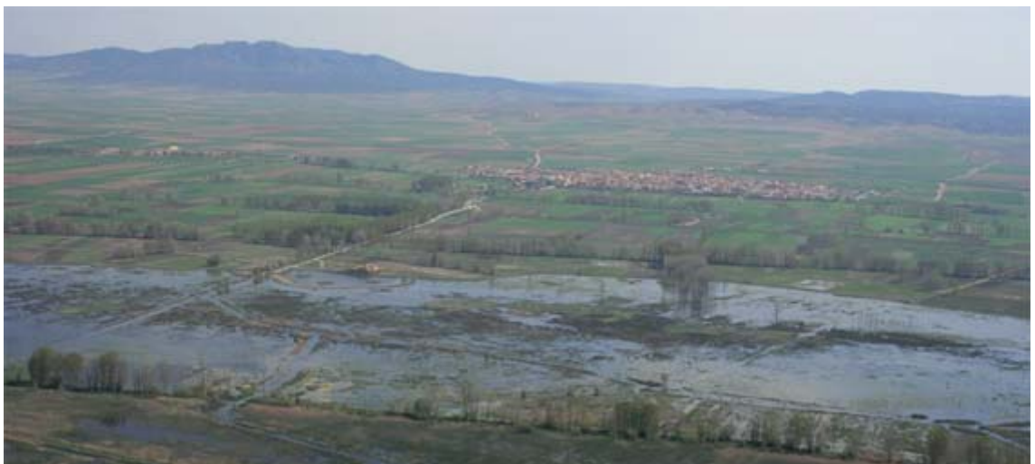
The “Cañizar de Villarquemado” wetland was drained in the XVIII century. Now it is being restored

A set of water saving measures have also been identified, combining intake, transport, treatment, distribution and efficiency projects throughout the entire river basin. These programmes are accompanied by a set of projects focused on the restoration of rivers and river banks, the recovery of wetlands, the restoration of sediment balances and hydrological regimes, the removal of polluted sediments, the control of invasive species and other measures aimed at improving the ecological status of the river basin ecosystem.