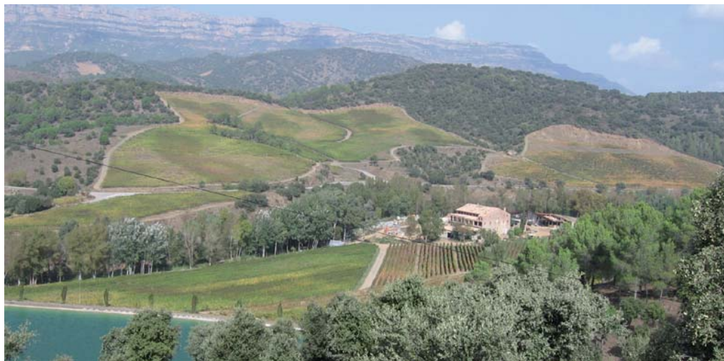
...to a nowadays highly technified and water efficient irrigated agriculture

Meeting the challenge of governing this uneven and uncertain supply of water lies at the heart of both the relative success and the current challenges of economic development in the Ebro River basin. To adapt the available water resources to the times, locations and quantities of services demanded by the economy, the Ebro has been gradually transformed into one of the most regulated river basins in the world. The 108 big dams built provide a storage capacity of 7,580 million cubic metres, equivalent to more than half of the average long-term renewable water supply of the river basin (estimated at 14,623 million cubic metres).