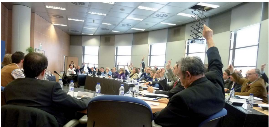
Public participation. The Ebro River Basin Council where different stakeholders are represented.

Significant advances have been made in controlling diffuse pollution, mainly through changes in agricultural practices and also through the management of pollution from scattered livestock in the upper reaches of the river basin. In 2008, already 74% of the water bodies assessed were of a good ecological status.