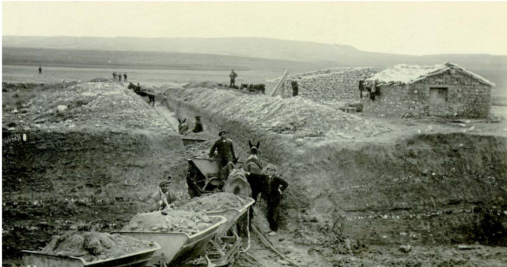
From the first irrigation works carried out by the Ebro River Basin Authority in 1927...

Located in the North East of the Iberian Peninsula, the Ebro river basin covers 85,700 square kilometres (17.3% of the Spanish soil). The average rainfall of 622 mm/year is unevenly distributed both in time and space. The spatial distribution can vary from 3,800 mm/year up in the Pyrenees to just 100 mm/year down in the central river valley where the main economic activities are located. A Mediterranean river basin rainfall is variable through time and may range between 800 and 450 mm in wet and dry years.