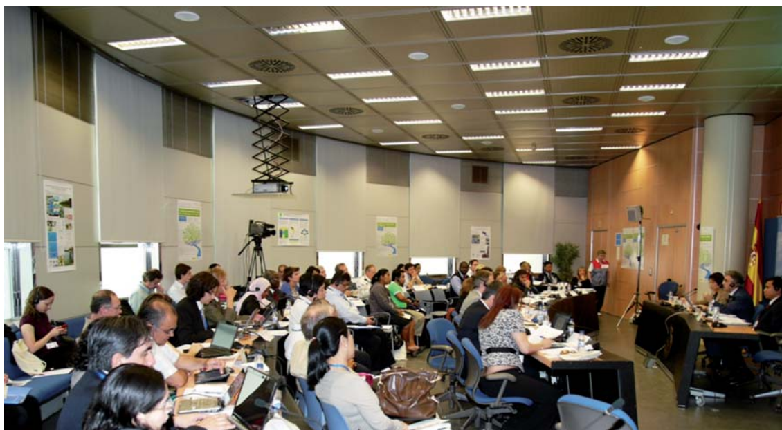
Session on water planning at the conference “Water in the Green Economy in Practice: Towards Rio+20”

Climate change will increase the uncertainty and variability of water availability and will reduce the security of water services. Increasing water scarcity and variability (occurrence of droughts and floods) will affect rain-fed agriculture and water supply for domestic use, energy, industry and agriculture, and will likely generate pressures for increasing irrigation and cultivating marginal lands. Water planning must provide the institutional space to build a collective response to the climate change challenge and build the resilience of water management.