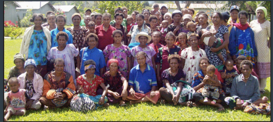
Women of the Jiwaka province, Highlands region PNG, displaced by armed conflict supported by Voice for Change for their economic and psychological recovery.